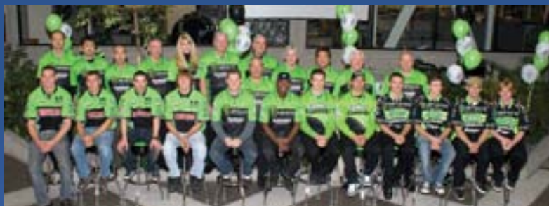
(Right and below)

It's a new racing year and Kawasaki's Ryan Villopoto and James Stewart are already beginning the year with a bang, as they dominated the first round of the AMA Supercross Series at Anaheim Stadium.